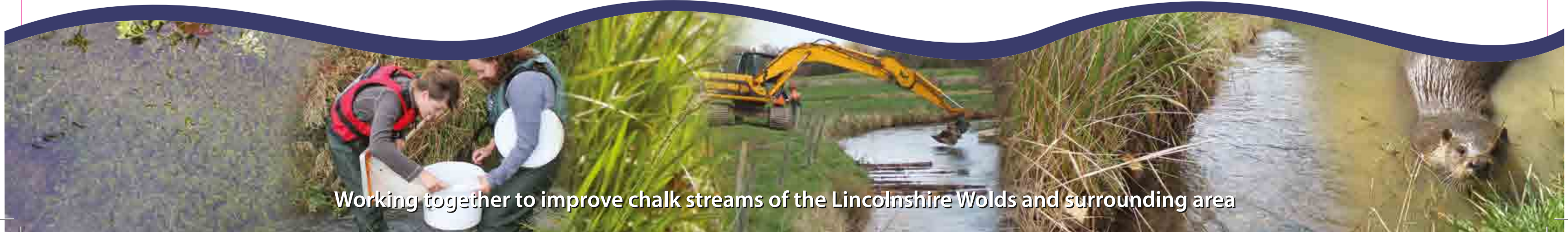
Working together to improve chalk streams of the Lincolnshire Wolds and surrounding area

The LCSP is always planning work to improve the chalk streams. Potential projects may include work on the River Bain, Waithe Beck, Lacey Beck and River Lymn. The LCSP are also exploring potential ark sites for the native white-clawed crayfish. The LCSP will continue to work with communities, farmers and landowners to improve their local streams – if you think we can help, please get in touch.