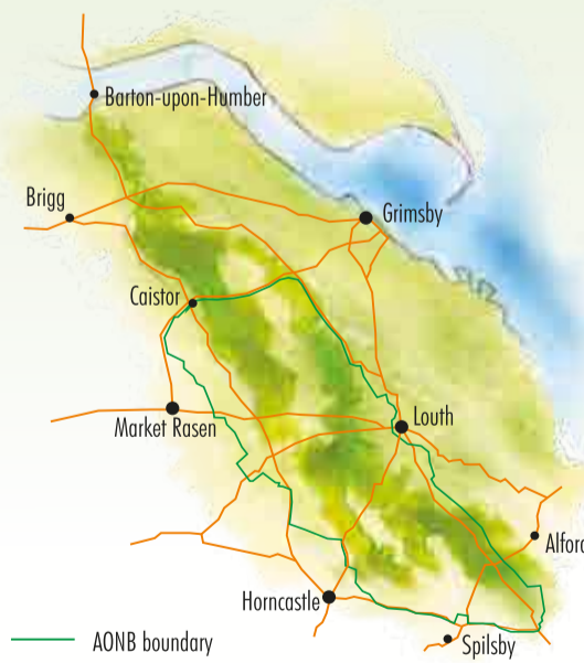
© Lincolnshire Wolds Countryside Service 0417 706. Designed & Produced by www.dagraphics.co.uk

A Countryside Service helps to protect and enhance the landscape through partnership projects with local landowners, farmers, parish councils, businesses and residents of the Wolds.