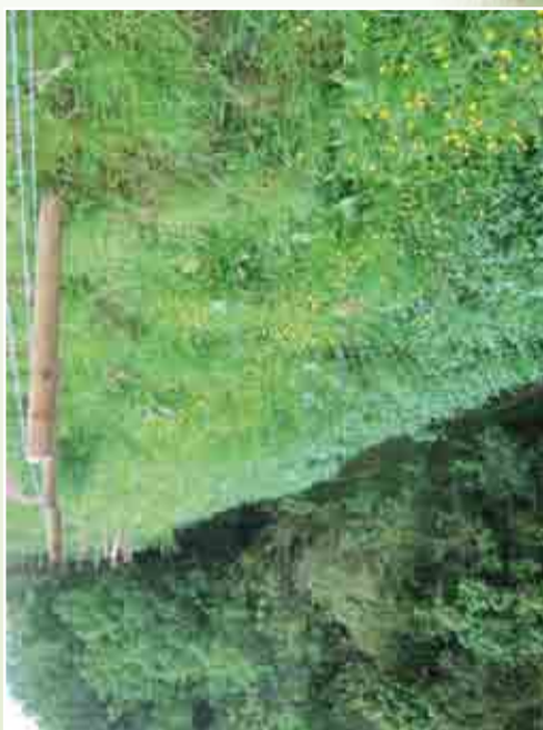
After: Fencing installed to limit access to livestock