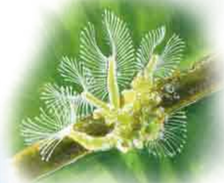
A rare Crystal Moss Animal ( Lyphopus crystallinus ) found in the Lincolnshire blow wells

A blow well is a type of groundwater spring, which is seldom (if at all) found across the British Isles except for the coastal margins of Lincolnshire. In this area the chalk is covered with clay and the groundwater here is under pressure (artesian). Where there is an opening in the clay from the chalk to the surface and there is enough pressure the groundwater finds its way to the surface forming a blow well.