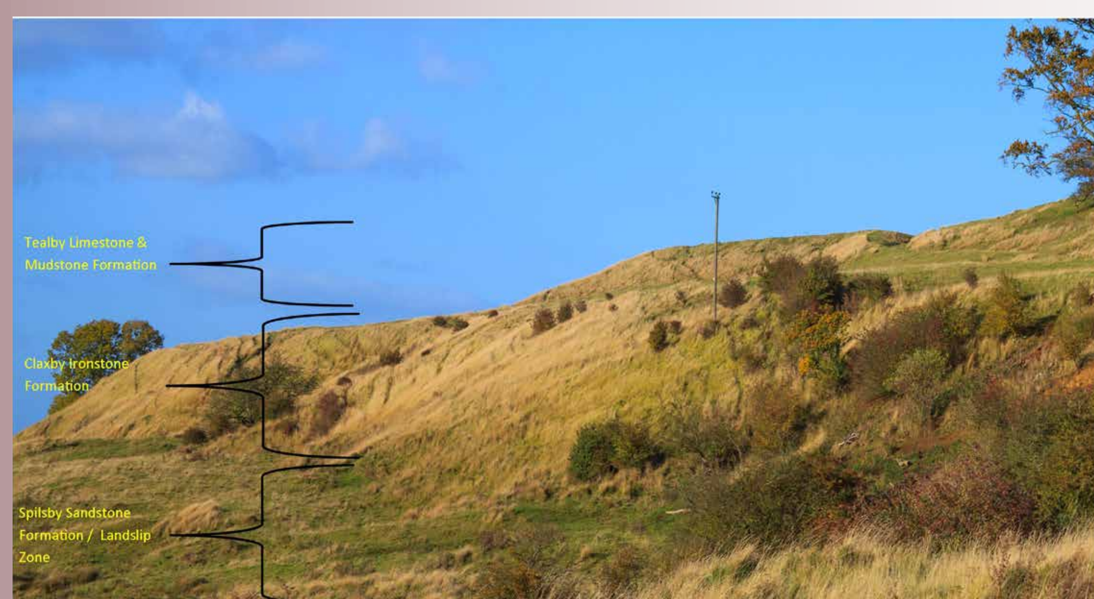
Geomorphology at Claxby Mine

The iron ore was extracted from the Claxby Ironstone Formation.