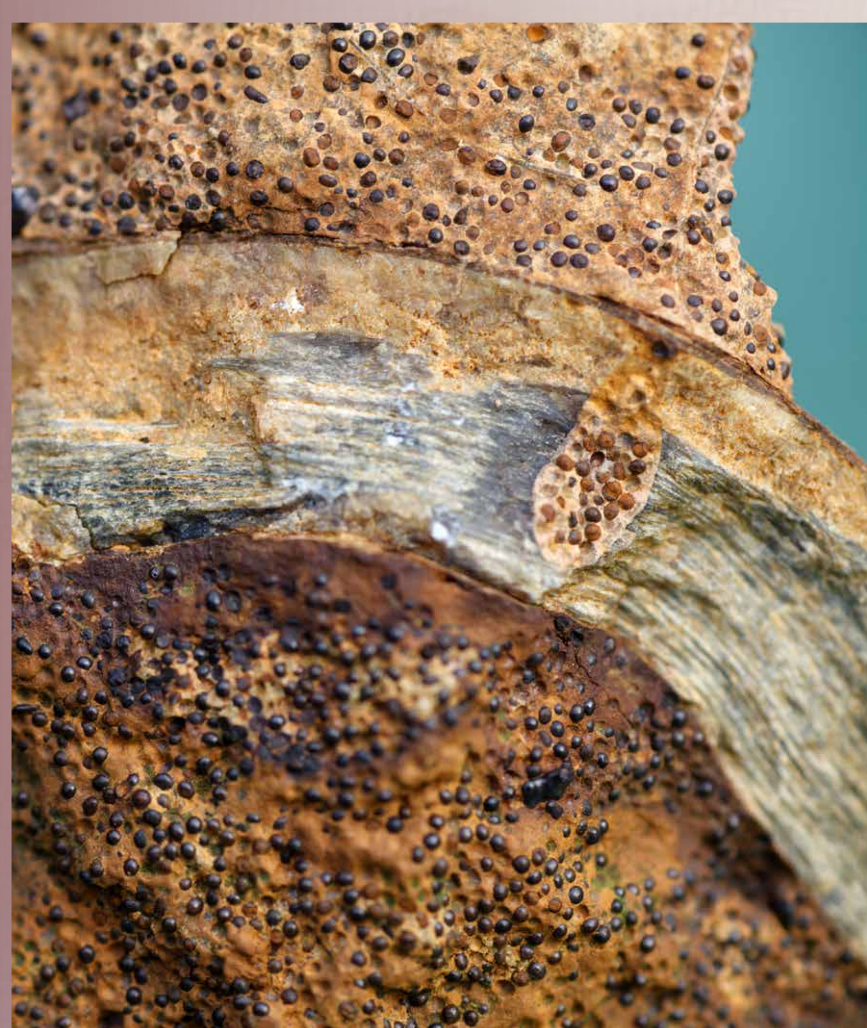
Close up image of Claxby Ironstone showing 'gunshot' effect caused by tiny, spherical oolites

The fossilised remains of squid like creatures called belemnites are common in the sediments of the Claxby and Tealby Formations