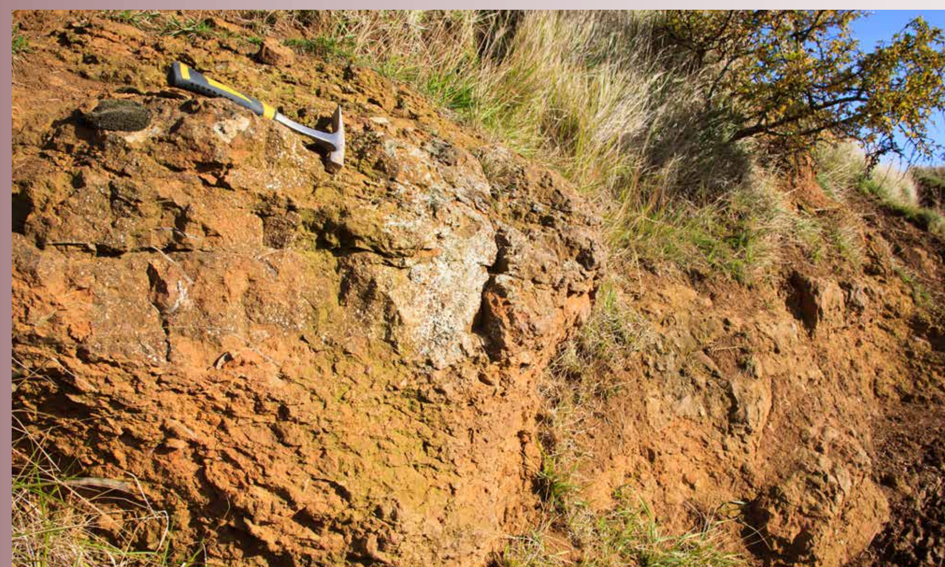
Claxby Ironstone outcrop at Claxby Mine

The geology of the west facing escarpment between Claxby and Nettleton is reflected in the landscape. The relatively hard limestone and ironstone beds are separated by softer, less durable mudstones, clays and sands. This is an unstable mix and there is much evidence of landslips along the bottom of the slope.