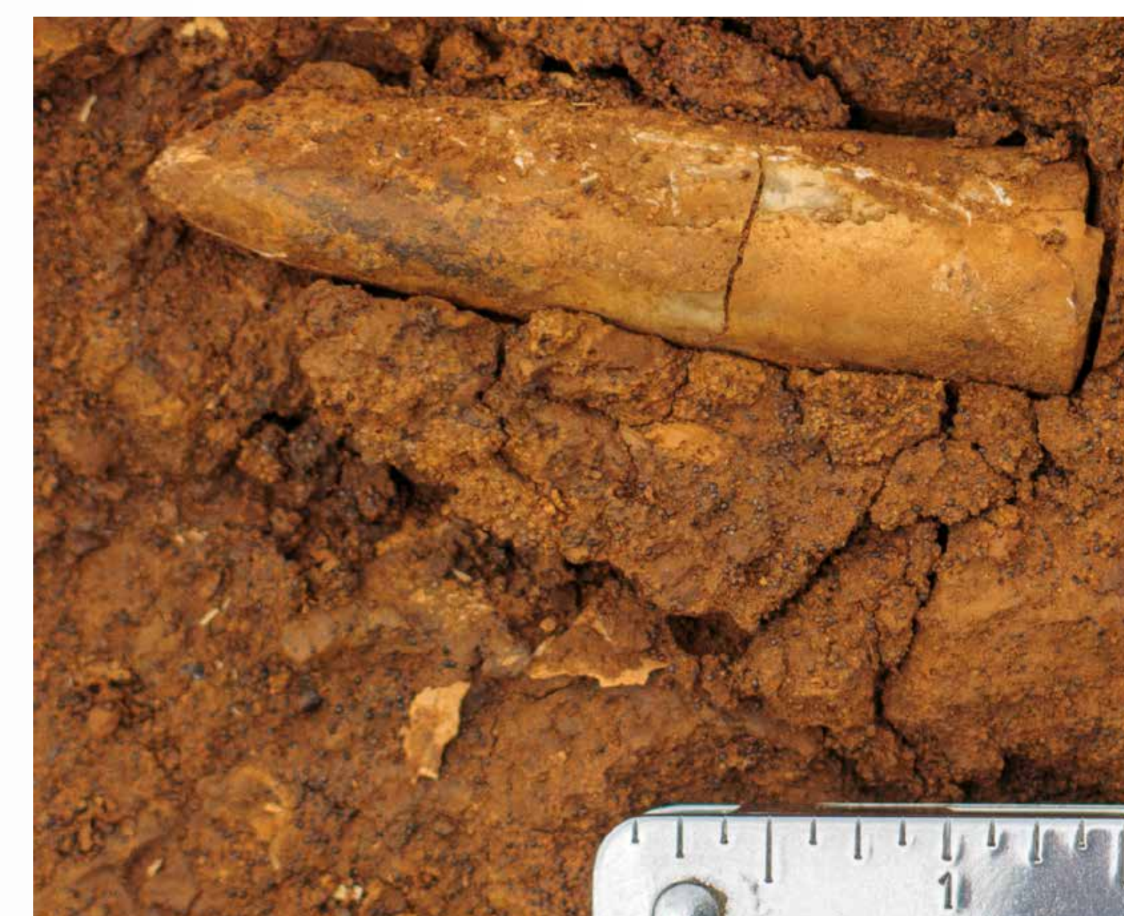
Belemnite in Claxby Ironstone

A small outcrop of Claxby Ironstone close to a collapsed entrance to the Claxby mine. It is a coarse iron rich oolite (sedimentary rock formed from tiny, spherical, fish-egg like grains), containing many fossil shells.