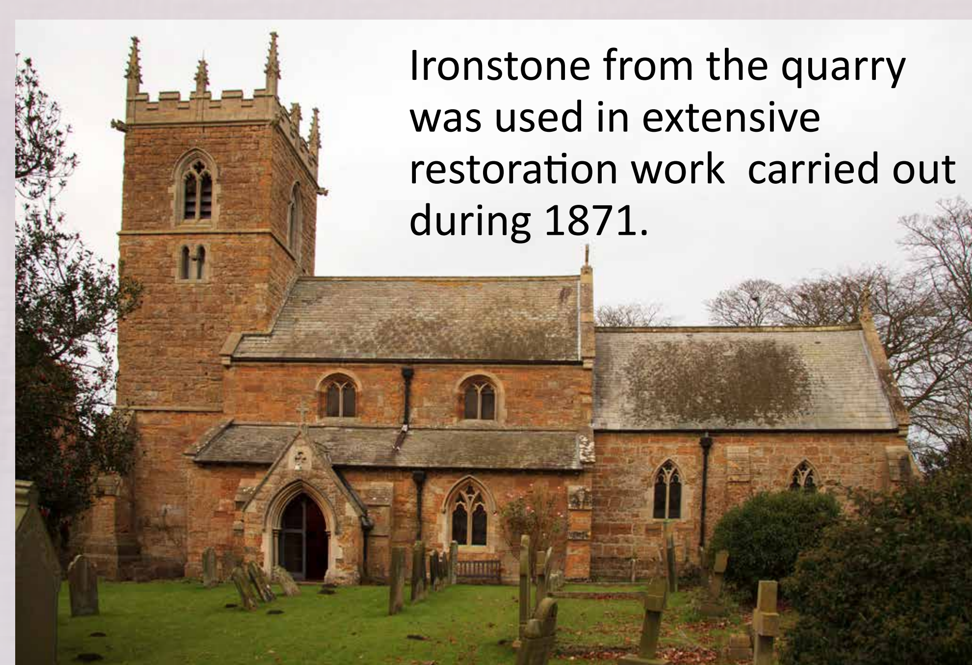
St Mary's Church, Claxby