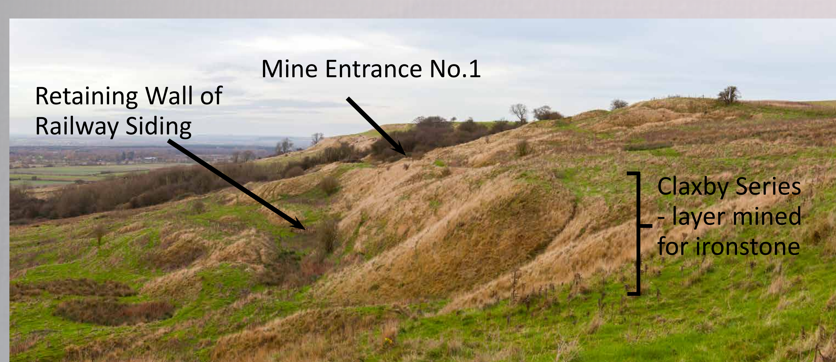
Post Mining Landscape