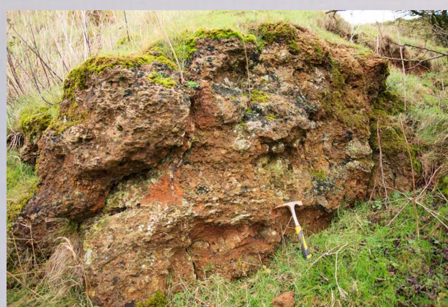
Ironstone Outcrop in Quarry