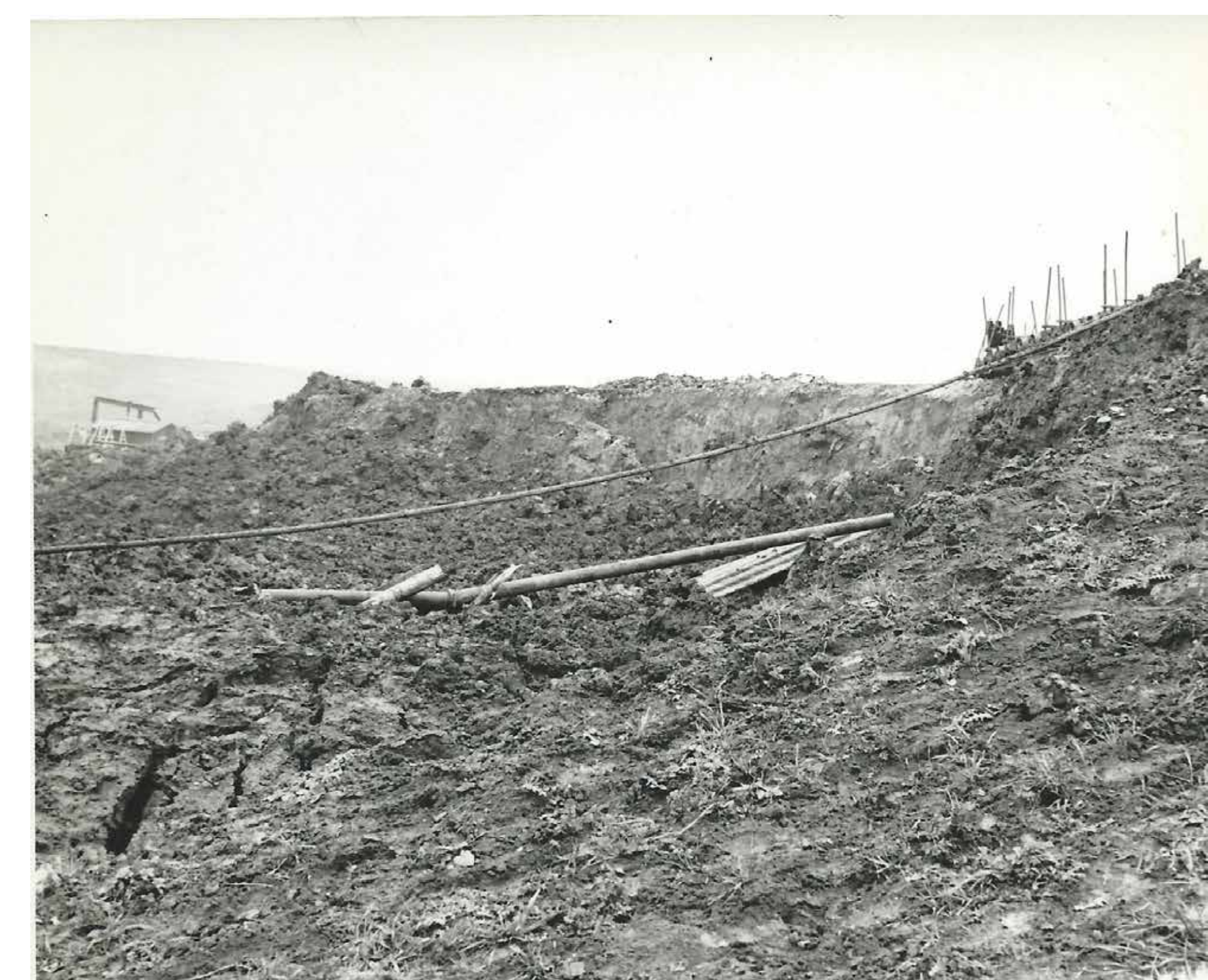
A landslide on the unstable hillside created problems in the mid 1950s