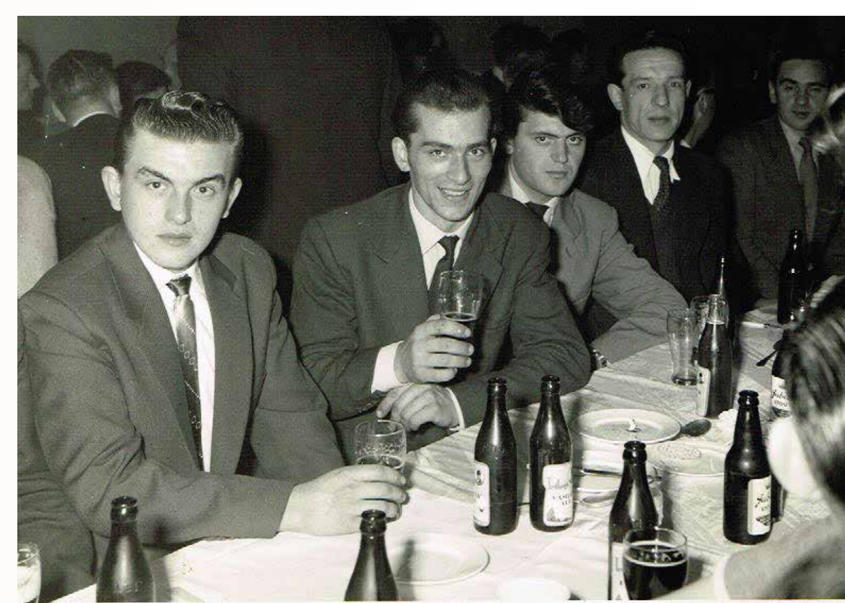
Social club drinkers

Horseshoes from the last pit ponies were used to make the annual Bowls Trophy.