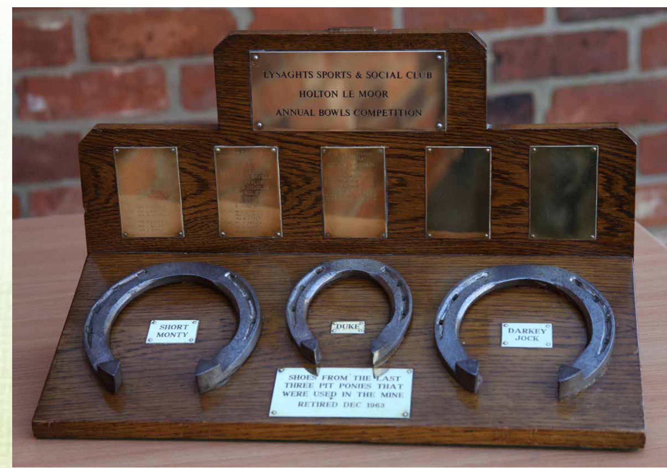
Annual Bowls Trophy