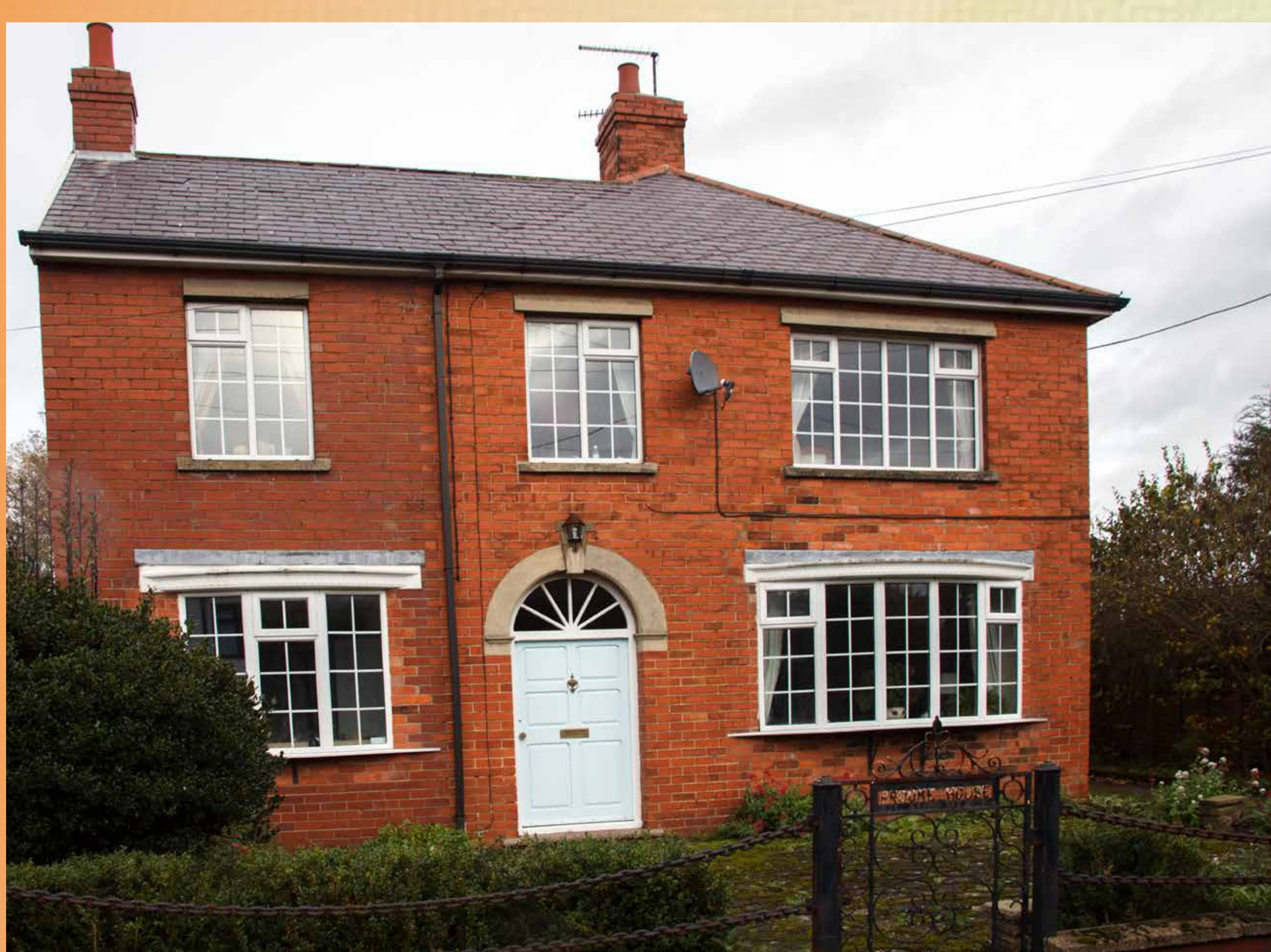
The mine manager's house in Cook's Lane

Houses were built for miners in Cooks Lane, Nettleton. The first and largest house was for the Mine Manager and his Under-Manager lived next door. Housing attracted workers to come from other areas to work in the Nettleton Mines. The name Orb Cottages was a link to the Orb Works in Newport, Lysaghts Head Office in South Wales