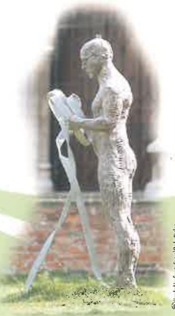
Sculpture of man trying to make sense of meridian line - Louth Art Trail