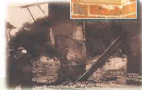
Flood damage - Bridge Street