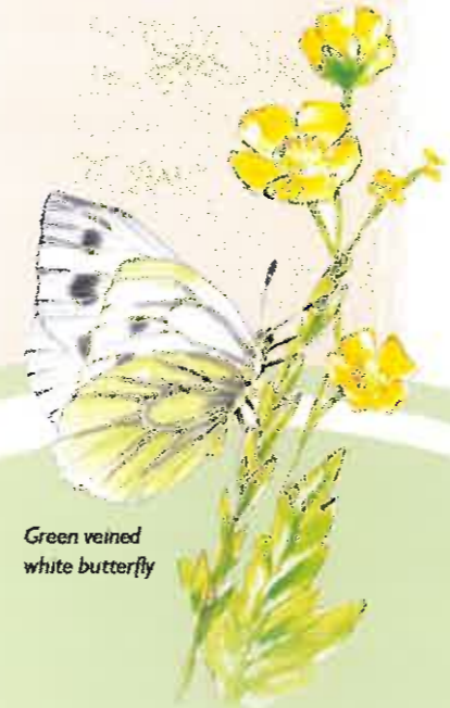
Green veined white butterfly

This is a delightful walk taking you high into the Wolds. There are fine views to the coast and back to Louth with St James's Church spire visible for miles. Walking along tracks and paths, this really does give a flavour of hilly Lincolnshire.