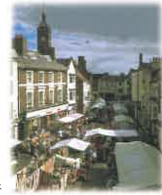
Market day in Louth

Louth is a thriving market town with distinctive architecture and independent shops. The town has always been an important centre in the district, but became a major trading area in the 1770s with the building of a canal.