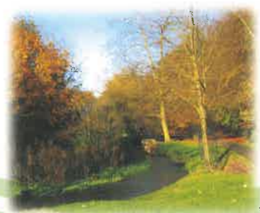
The River Lud meandering through Hubbard's Hills