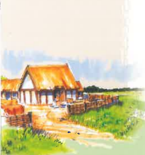
A typical style medieval village

The Round Louth Walk circles the historic market town, journeying into the surrounding countryside of the Wolds and Marsh. Although the full walk is 14 miles long, there are shorter circular routes using various public footpaths back into the town if you don't want to do it all in one day.