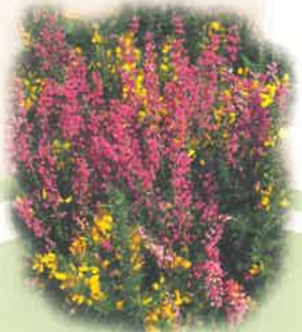
Bell heather is a common plant of drier heaths. Care should be taken not to mistake it for cross-leave heath which grows in more boggy areas

All three walks start from Market Rasen and head through fields over the Coversands; soils which are very deep but which dry out quickly and are subject to wind erosion. The second route follows the National Cycle Route for a distance, whilst the third route gives you the opportunity to explore a heathland nature reserve.