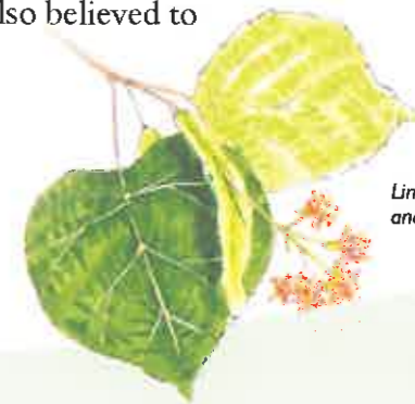
Lime leaves and flowers

The name Legsby originates from the old nordic meaning of Legg's farmstead or village, probably a notable chieftain of the area, whilst the name Linwood originates from the old English meaning of the common native woodland tree of this area, the small leaved lime or linden tree. The lime tree has been used for centuries as a decorative street tree as it was also believed to ward off evil. The soft, even grained wood does not warp and as such is ideal for carving and for making piano keys.