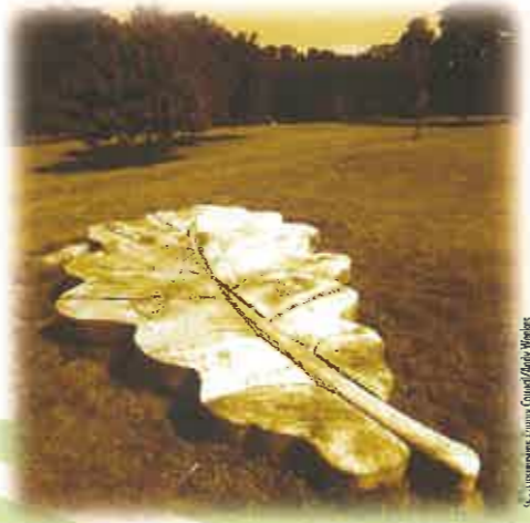
Oak leaf sculpture - Westgate Fields