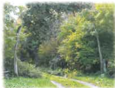
Whale bone arc - Welton Vale