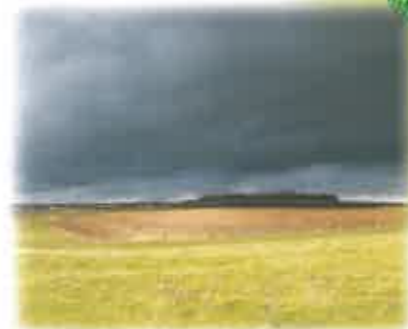
The disused quarry face

In the late 19th century, this former river valley was commercially quarried for sands and gravels. Extraction intensified during the 1st and 2nd World Wars to provide materials to build runways. The quarry ceased to operate in the late 1970s after nearly a century of excavations.