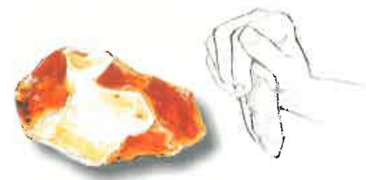
Hand axe and how it may have been used

The quarry is a designated geological Site of Special Scientific Interest and Regionally Important Geological Site due to its important sequence of ice age deposits. In the late 1960s and early 1970s hand axes and remains of straight-tusked elephant, giant deer and horse were discovered. The small quarry face you can see is nationally important as this is the southern limit that the ice-sheet extended into Lincolnshire.